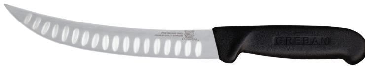
GRANTON EDGE KNIVES